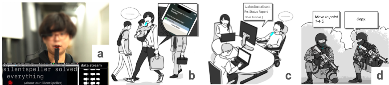
Figure 1: a) A SilentSpeller user wears the SmartPalate retainer whose 124 electrodes sense the position of the tongue at 100Hz. Applications include b) Hands-busy situations where speech is socially inappropriate c) users with low manual dexterity working in open office environments d) United Nations operations where silent communication is necessary

Jun Rekimoto The University of Tokyo Tokyo, Japan